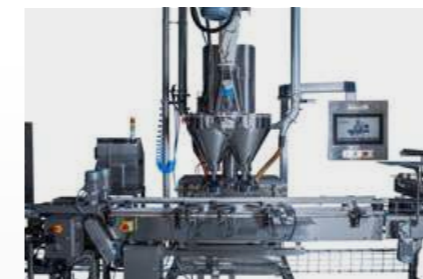
Filling / dosing